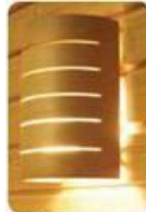
Warm looking sauna lamps

Improvements to main foyer layout to include: the retail area, memberships area, vending and seating.