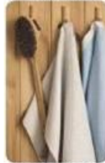
Clothes hooks and benches on external walls. Also a single shower.