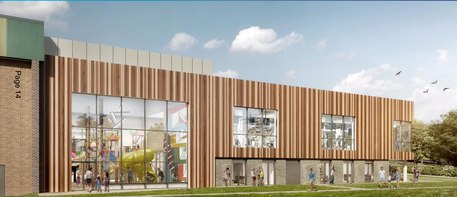
Illustrative elevation – South facing looking out on to Colenso Road