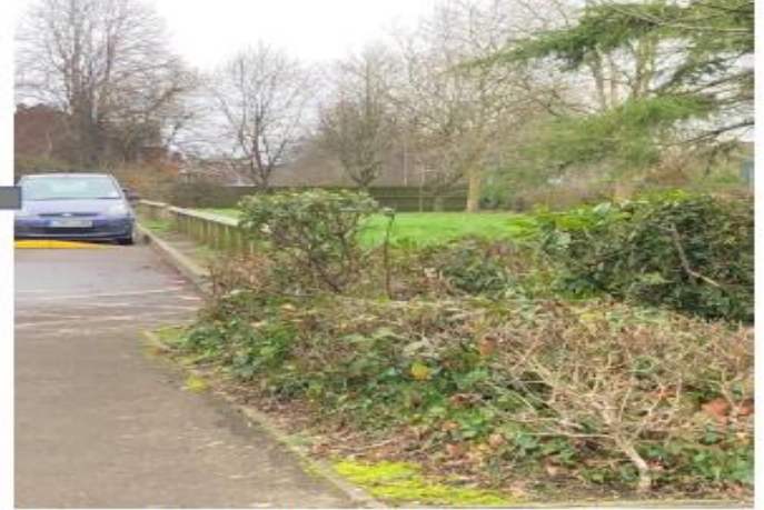
Grass area proposed for car park extension (32 additional bays)